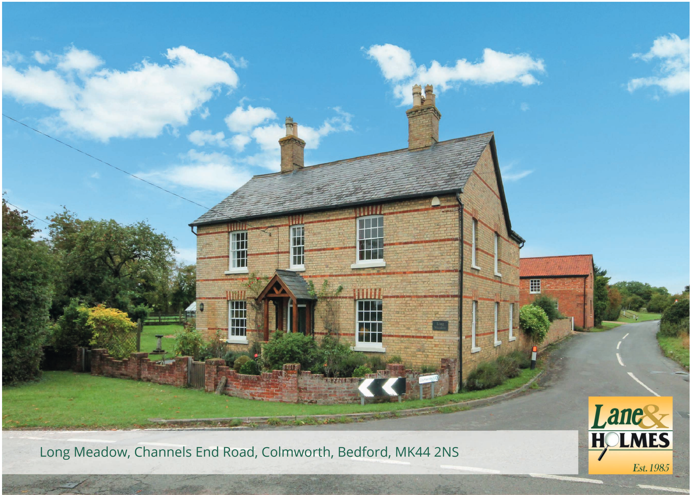
Long Meadow, Channels End Road, Colmworth, Bedford, MK44 2NS